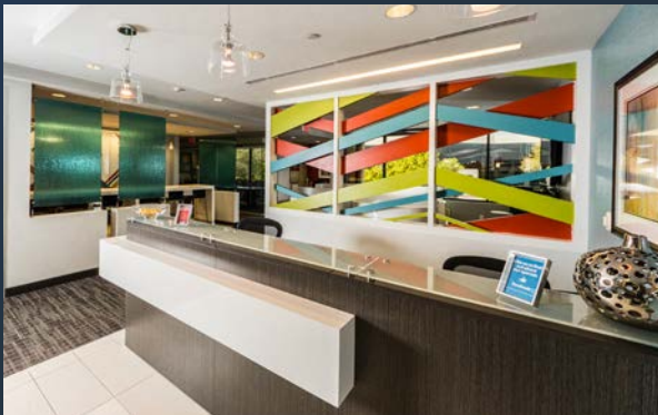
BUILDING 300 | 3505 Lake Lynda Drive