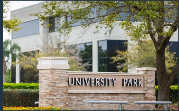
BUILDING 200 | 3504 Lake Lynda Drive