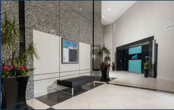
BUILDING 100 | 3452 Lake Lynda Drive