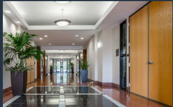
BUILDING 400 | 11301 Corporate Boulevard